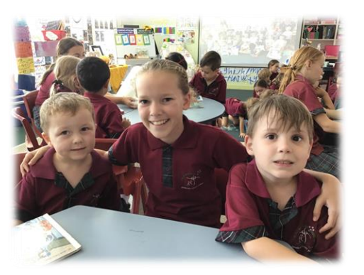
Prep students meet their Year 6 buddy within the first few weeks of school.

Starting school is a very important time for every child and can be very emotional for many (including parents). To ensure a smooth transition, school should be an environment in which your child feels comfortable and supported.